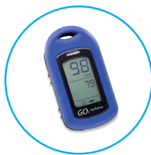
Blood oxygen Monitor